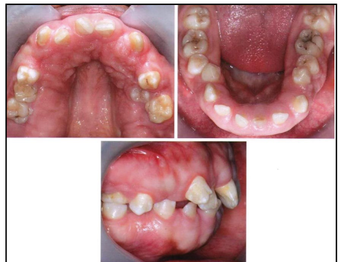
Figure 1. Gingival overgrowth with displacement and rotation of the teeth and diastema.

Pre and post-operative photographs and lateral cephalographs are illustrated at Figure 2 .