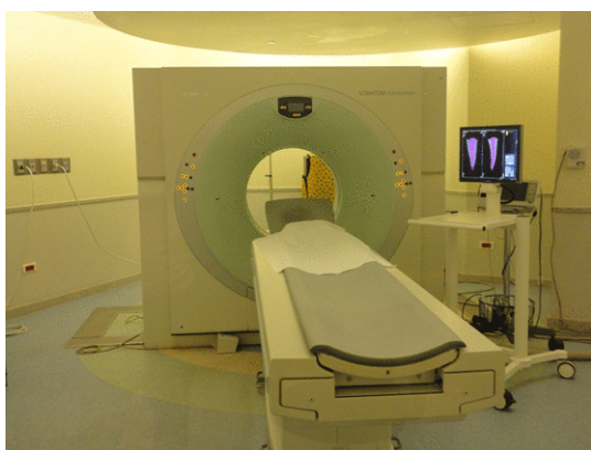
Figure 1. CT machine used in the study.

The specimens were scanned pre- and postoperatively using CT (Multislice Somatom Sensation 64 VB30B) and Three-dimensional images of the roots were obtained using a Siemens Somatom CT scanner (Figure 1 and 2). Pre- and postoperative measurements of the volume of filling material in coronal, middle and apical thirds allowed calculation of the mean percentage of residual filling material (%) during retreatment procedures; this value was recorded in a spreadsheet.