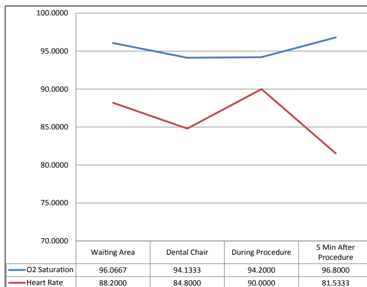
Figure 2. Variations in heart rate and oxygen saturation at different time intervals during the placement of the implant.

The pain perception score was correlated to possible predictive tools for pain; heart rate in the waiting area, oxygen saturation in the waiting area, DAS score and salivary cortisol levels. It was seen that only the heart rate showed a significant positive correlation to the pain score reported ( Table 3 ). The linear regression model showed that only the heart rate in the waiting area was a reliable predictor of reported pain ( Table 4 ). The second regression model showed that when the heart rate during the procedure was used as the dependent variable, here again only the heart rate in the waiting area was the only reliable predictor ( Table 5 ).