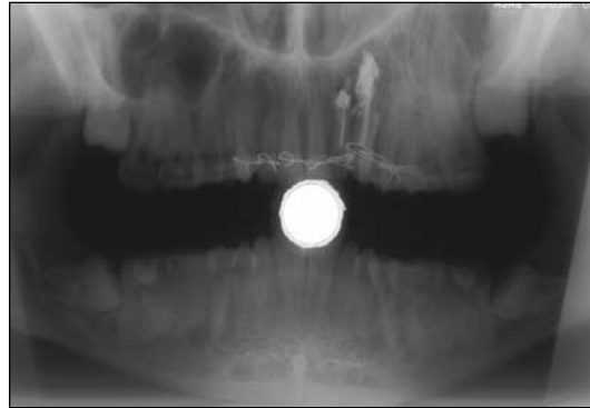
Figure 4. The roentgenogram of Patient S. by the 10 th day after performing the operation