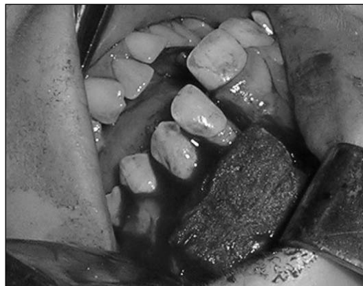
Figure 2. The operation stage: teeth 22, 23 are replanted into a prepared bone bed; the tooth roots are covered with the LitAr material.

The teeth were extracted from a preservation tank and then replanted into a prepared bed, the LitAr material was placed on the bone again ( Figure 2 ), and the stitches were put in