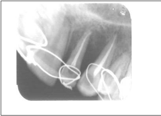
Figure 5. The roentgenogram of Patient S., 2 months after performing the operation