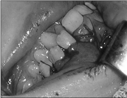
Figure 3. The operation stage: the wound is sutured