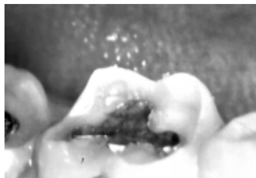
Complete detrition of the occlusal surface in some of the lateral teeth (the occlusal relief disappears) with excessive dentine loss