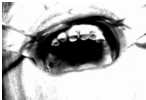
Complete detrition of the free edge of all the frontal incisors involving important dentine loss (L. Ieremia's personal case)