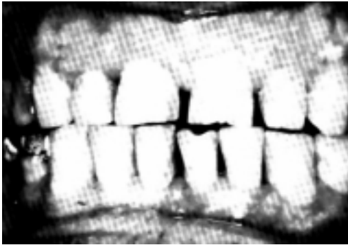
Partial detrition of the free edge in some of the frontal teeth involving enamel loss and partial dentine loss