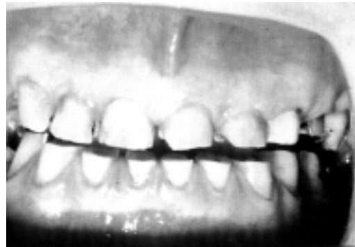
Partial detrition of the free edge in all the frontal teeth involving enamel loss and partial dentine loss