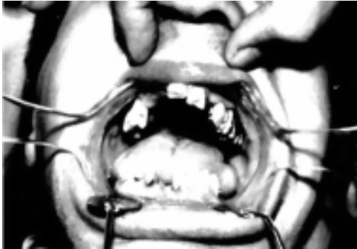
Complete detrition of the free edge in some of the frontal incisors involving important dentine loss