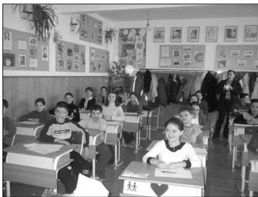
Figure 1. Subjects of study

Study conditions were explained to children and their parents, and after parental consent had been granted, to the school personnel ( figure 1 ).