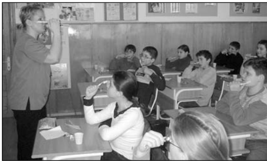
Figure 6. Instructing the group