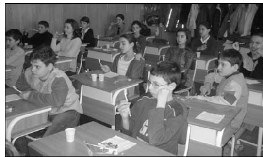
Figure 7. Instructing the group