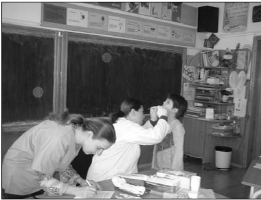
Figure 14. Filling in the individual charts