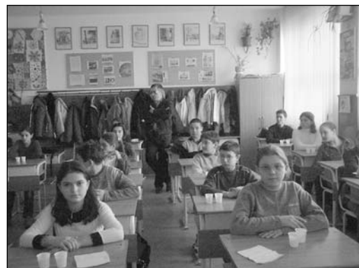
Figure 2. Oral education hour

After this first meeting, the parents and teachers of the children received an 1-hour oral presentation on the etiology and prevention of dental disease. Information concerning the importance of tooth cleaning was also given and parental support was requested ( figure 2 ).