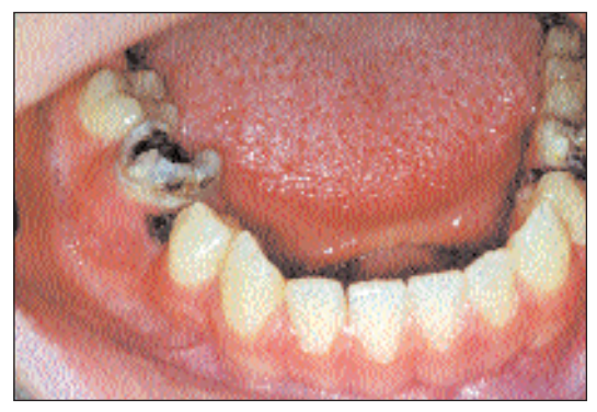
Figure 1. Intra-oral appearance of the patient demonstrating large caries in the mandibular right first molar

During the first visit, after placing a rubber dam, the necrotic content of pulp chamber and root canal was removed. Working lenght was