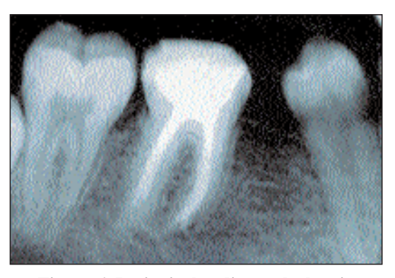
Figure 6. Periapical radiograph showing complete disappearance of the radiolucent lesion two months after the treatment

As suggested in literature, nonsurgical endodontic therapy is the treatment of choice of such lesions and should be attempted first [6]. In the present case, only nonsurgical endodontic therapy was carried out and the sinus tract was successfully treated with minimal scar forma-