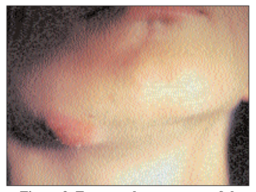
Figure 2. Extra-oral appearance of the patient presenting a sinus tract on the right cheek

Odontogenic cutaneous sinus tracts in the face and neck region are rare [2] and present a