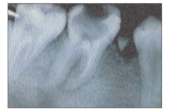
Figure 3. Periapical radiograph showing periapical radiolucent lesion associated with the roots of mandibular right first molar