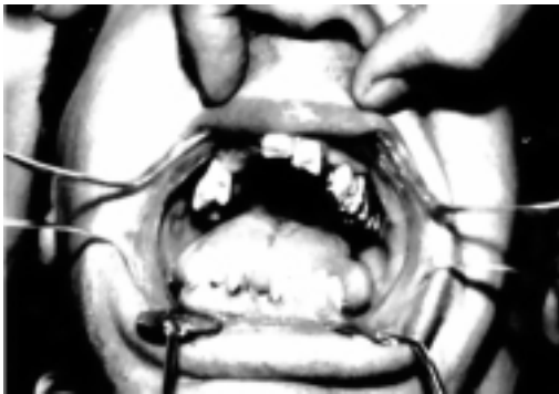
Complete detrition of the free edge in some of the frontal incisors involving important dentine loss