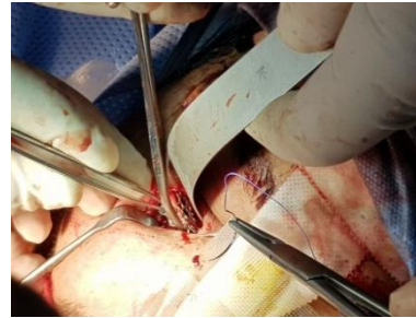
Fig 2: Intraoperative view