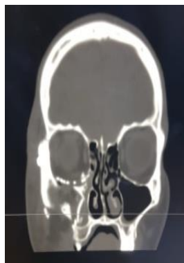
Fig 4: Coronal View Post Op