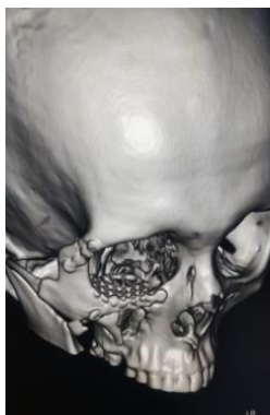
Fig 3: Post Op 3D view